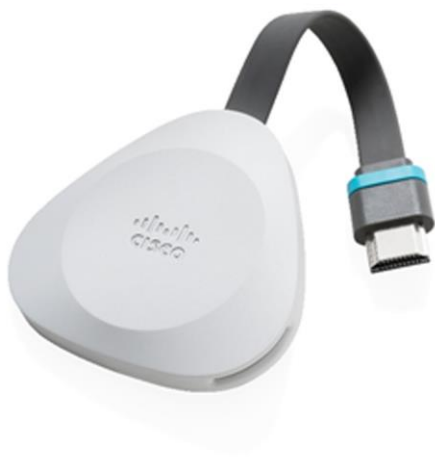
Figure 1. Cisco Webex Share

Cisco Webex Share complements the premium portfolio of Cisco Webex collaboration devices, enabling conference rooms and huddle spaces to offer the same Webex user experience as Cisco's video devices.