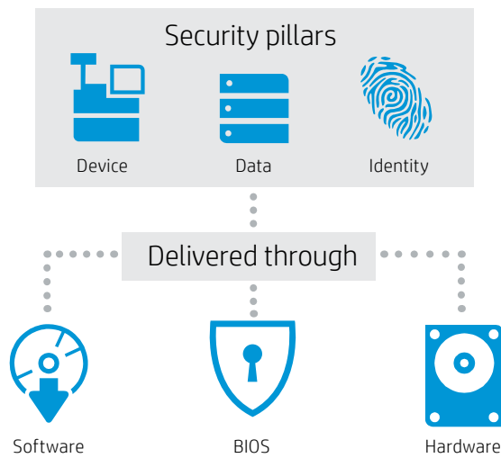
Figure 1. HP Client Security delivers end-to-end protection at all levels of the business IT environment.

Our client security strategy includes creating multiple layers of protection across devices, data, and identity. Along with delivering HP security tools through software, such as HP Client Security and HP Sure Start, we provide additional features in hardware and embed strong protections all the way down to the BIOS level. IT managers can centrally configure, deploy, and update these tools without interrupting employee productivity.