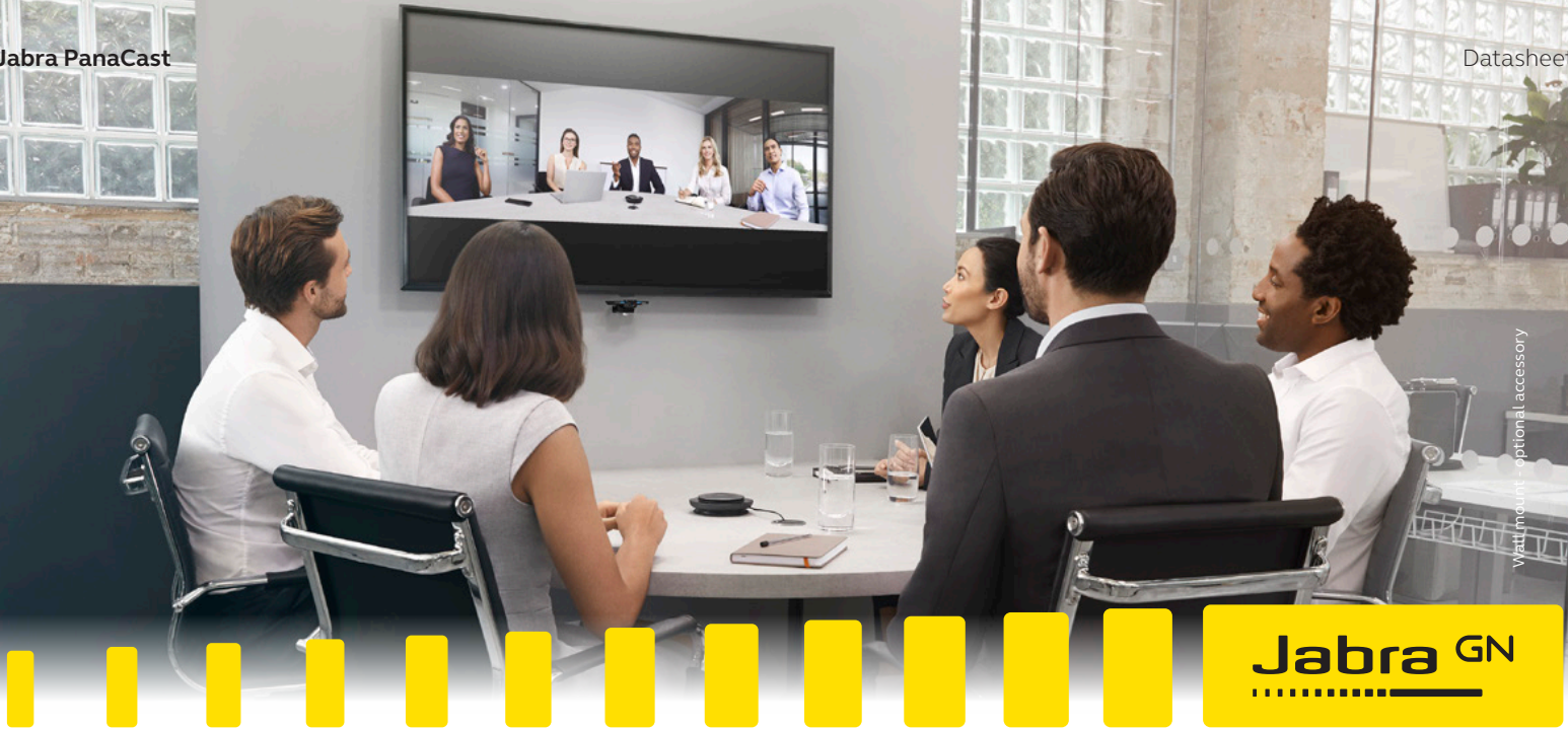
Wall mount - optional accessory