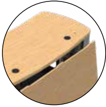
REMOVABLE MODESTY PANEL