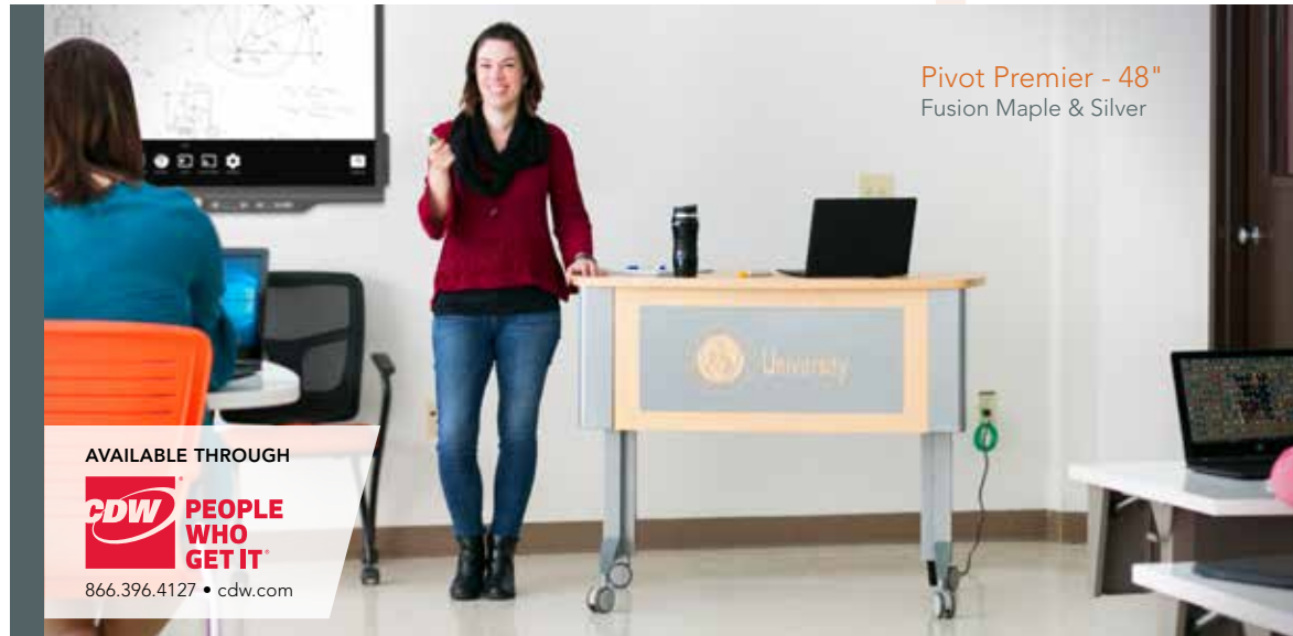
Pivot Premier - 48" Fusion Maple & Silver