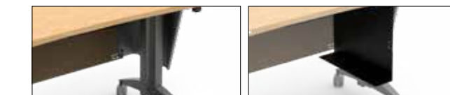
ORDER CODE 0 None