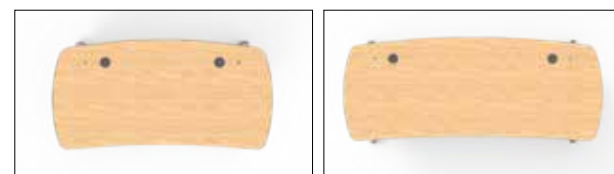
ORDER CODE 1 48" Worksurface