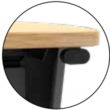
POWERED eLIFT LEGS