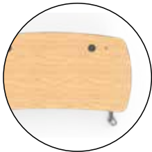
LARGE FUNCTIONAL WORKSURFACE