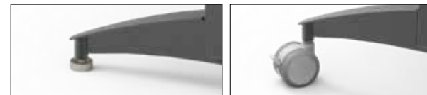
ORDER CODE 1 Glides