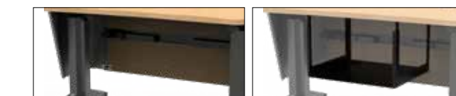
ORDER CODE 0 None