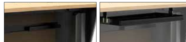
ORDER CODE 0 None