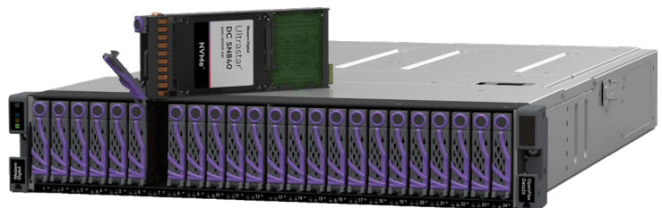
OpenFlex Data24 NVMe-oF Storage Platform

Flash technology has revolutionized the performance of storage systems and NVMe-oF technology extends flash storage to its full potential. The OpenFlex Data24 NVMe-oF Storage Platform provides the flexibility to meet varying requirements depending on data workload and performance requirements and is built to deliver screaming performance in software-defined storage environments. With low latency and consistently high bandwidth, data is accelerated to the speed of flash and is shareable with up to six hosts without a switch.