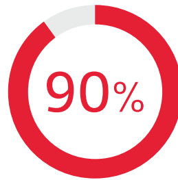
The percentage of enterprises that will rely on a mix of on-premises private clouds, public clouds and legacy platforms in 2021 1

While many public cloud offerings are essentially commodities, hyperscalers continue to compete with one another on both features and pricing, and a multicloud approach has become necessary in order to truly optimize a cloud environment. Gartner writes: "The decision may be driven by a variety of factors, including availability, performance, data sovereignty, regulatory requirements and labor costs."